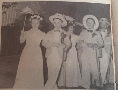
Closing Exercises—June, 1952